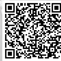
2024 IDA&E Progress Report

The annual Dr. George W. Counts Interest Group Dinner brought together colleagues dedicated to advancing health equity in the field of ID. This year, more than a dozen students from Los Angeles medical schools attended the event, engaging with leaders who champion diversity and inclusion at their institutions. The dinner provided a great opportunity to connect, inspire and support the next generation of ID and HIV professionals committed to access and equitable health care for all.